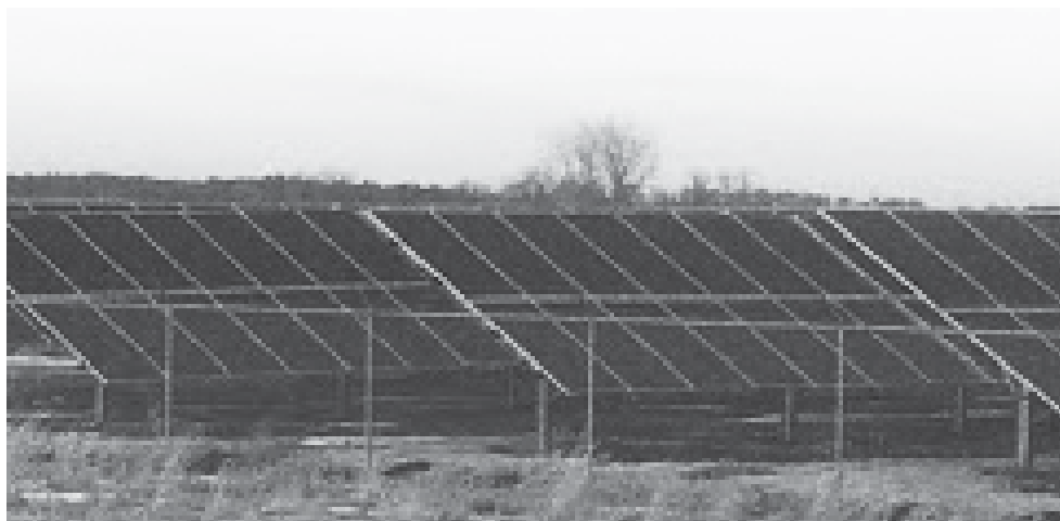
Rengstorf solar garden, located near Courtland, Minn., is one of two gardens that supplies solar energy to Mankato Area Public Schools.

"We are in a unique contract with Geronimo where we are into a locked purchase